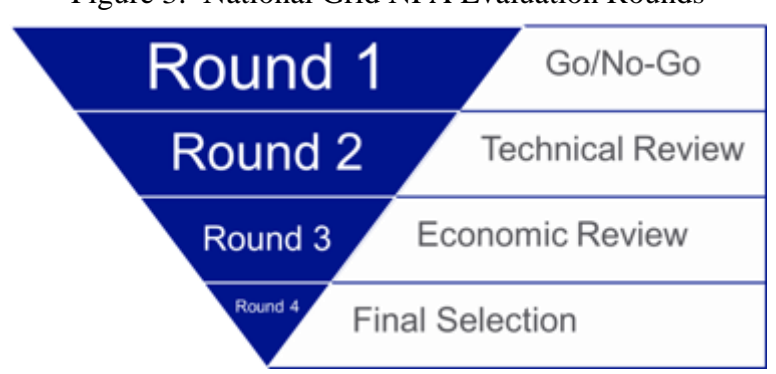
Figure 3: National Grid NPA Evaluation Rounds

This evaluation process is nearly identical to the process followed by the NWA program but has one difference. Namely, the NPA program considers and includes customer acceptance in Round 2.